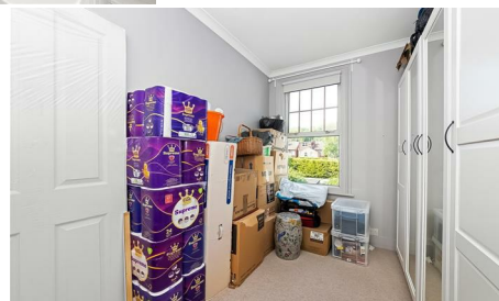
Lower Road, CR8

Approximate Gross Internal Area 72.1 sq m / 776 sq ft